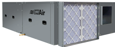
C13-Series Horizontal 2 - 10 Tons