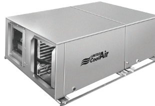
C-Series Horizontal 1 - 15 Tons Special Configuration Engineered to Order