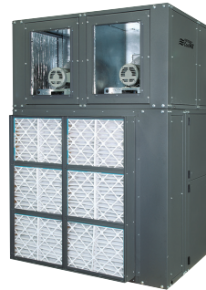
VariCool® EZ-Fit VAV, 12 - 90 Tons