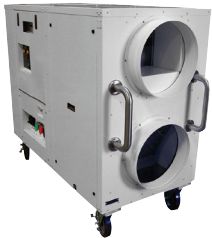
Portable Cooling and Heating Units 3-30 Tons