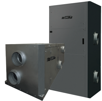
Alpha Aire Horizontal & Vertical 200 - 500 CFM