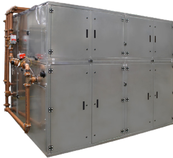
VariCool® Renovator 42 - 80 Tons