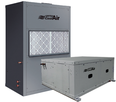
OmegaAir Horizontal & Vertical 100% Outside Air 150 - 3000 CFM