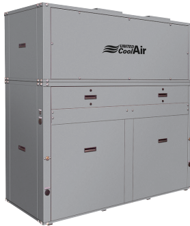
VertiCool Aurora Vertical, 3 - 35 Tons